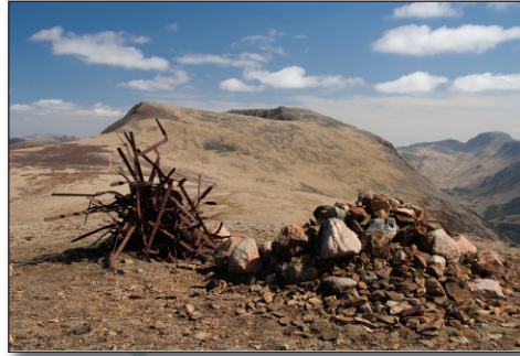
Summit of Starling Dodd