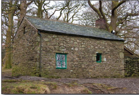
Holme Wood Bothy