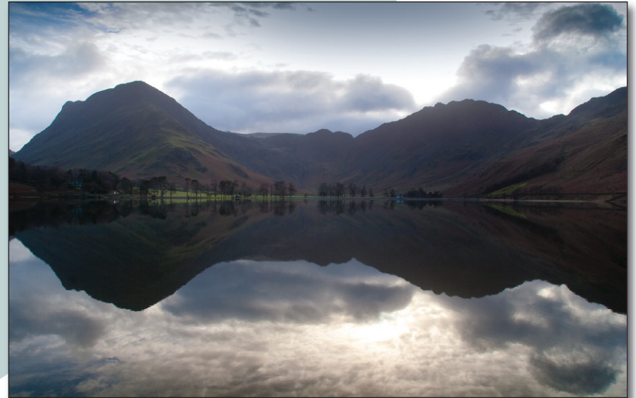
Reflections in Buttermere