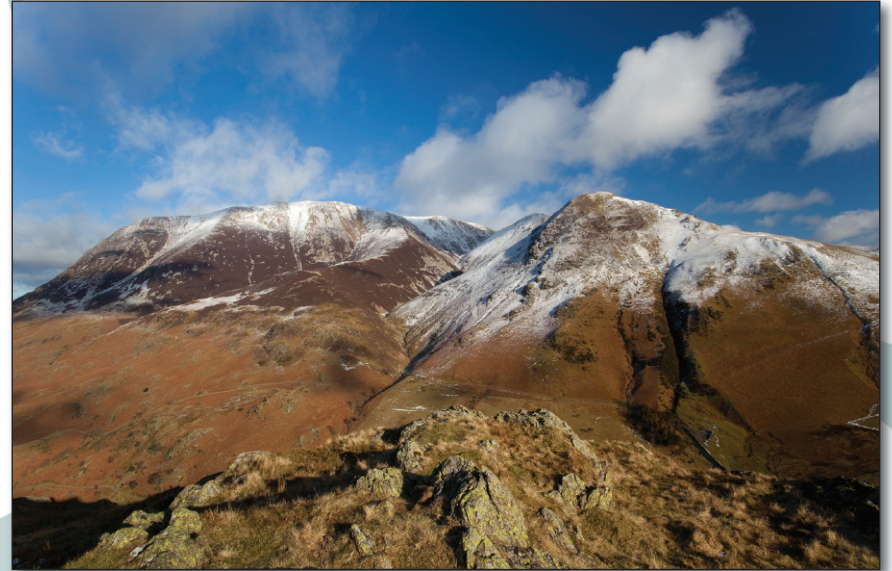
Grasmoor from the summit of Rannerdale Knotts